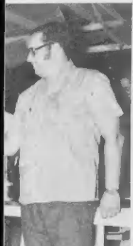
rophy from Miss by Bucuti Club a, for the largest